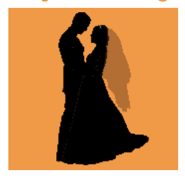
Give your daughter a wonderful wedding